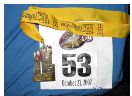
Robert Crampton at Tower of Terror 13K in MGM Studios, Orlando on October 27.